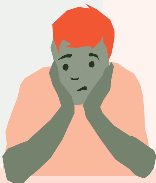
Figure 2: Common peer work challenges and solutions (8,9,11,21,26,29,30)

Table 4 provides a summary of associated stressors in the peer work role alongside some potential solutions. However, for more detailed information related to organisational responsibilities please refer to Orygen's peer work implementation toolkit for further information. Please also refer to part two of this clinical practice point, "How to peer." Youth peer workers' perspectives and advice about working in youth mental health services which provides specific feedback from established youth peer workers that may relate to some of the challenges and solutions identified in figure 2.