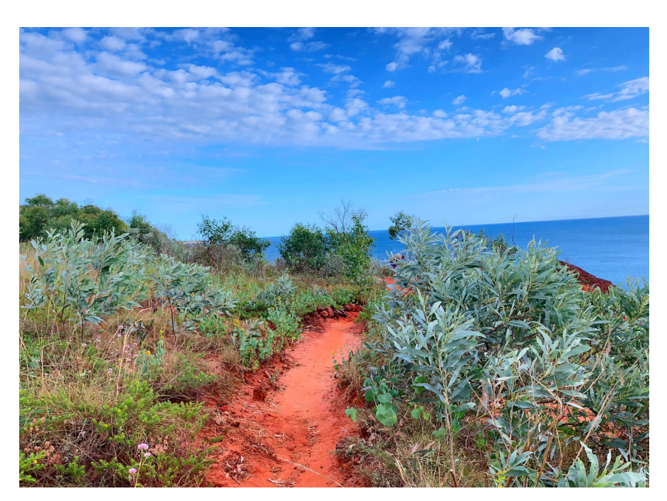
Life's a journey, you're important and you have a role to play in your family and community.