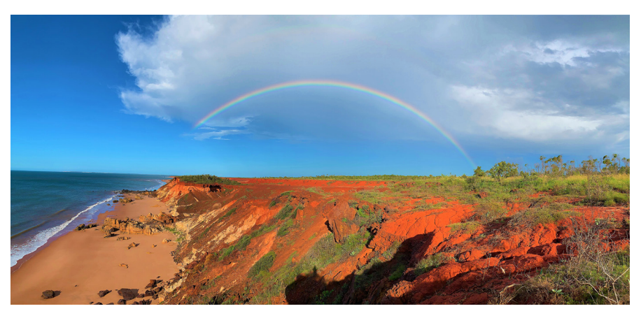
Rainbow.

This guide has been developed with the families and communities of young Aboriginal people.