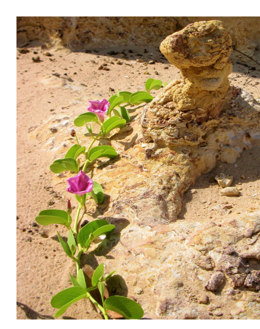
Morning glory on beach. Photo by Kathleen Cox Photography.

It's important to know that you are not alone.