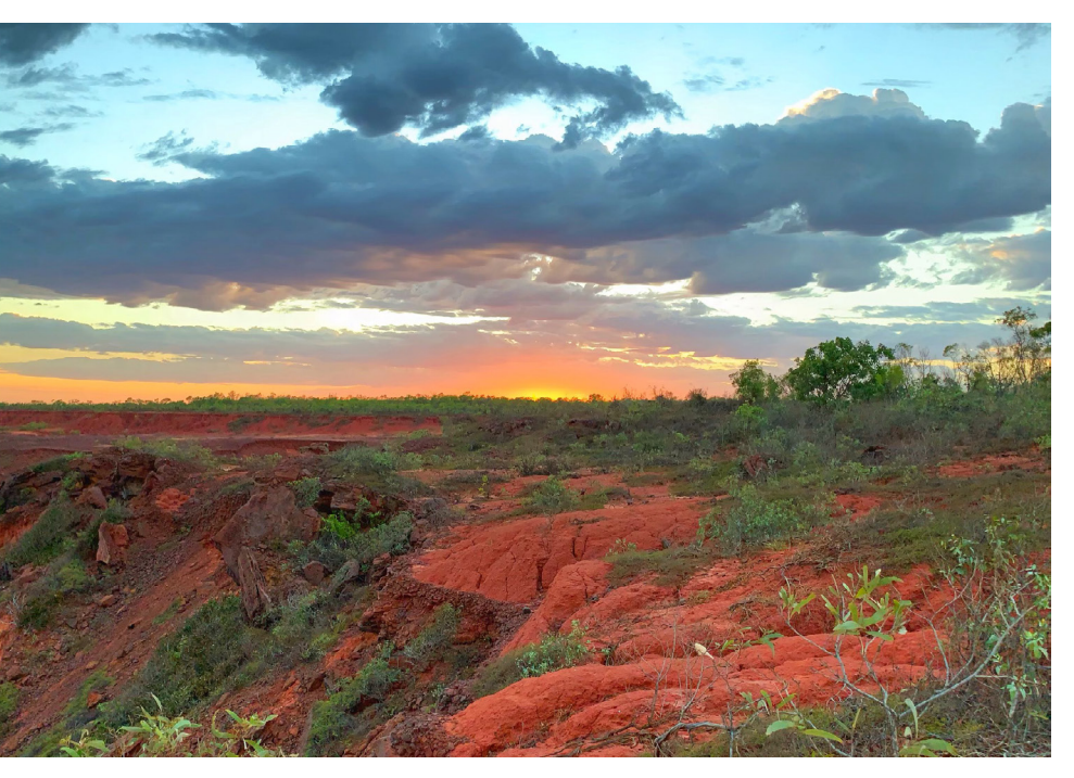
Even through the stormiest of times, the sun will always rise and bring light and warmth to you.

Keep letting them know you are there for them and that you love them.