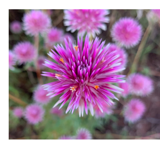
You are the centre of your inner self.

Yarn Safe for Aboriginal young people is a headspace campaign created with the help of 12 Aboriginal and Torres Strait Islander young people. Its aim is to help young Aboriginal and Torres Strait Islander Australians seek help for mental health.