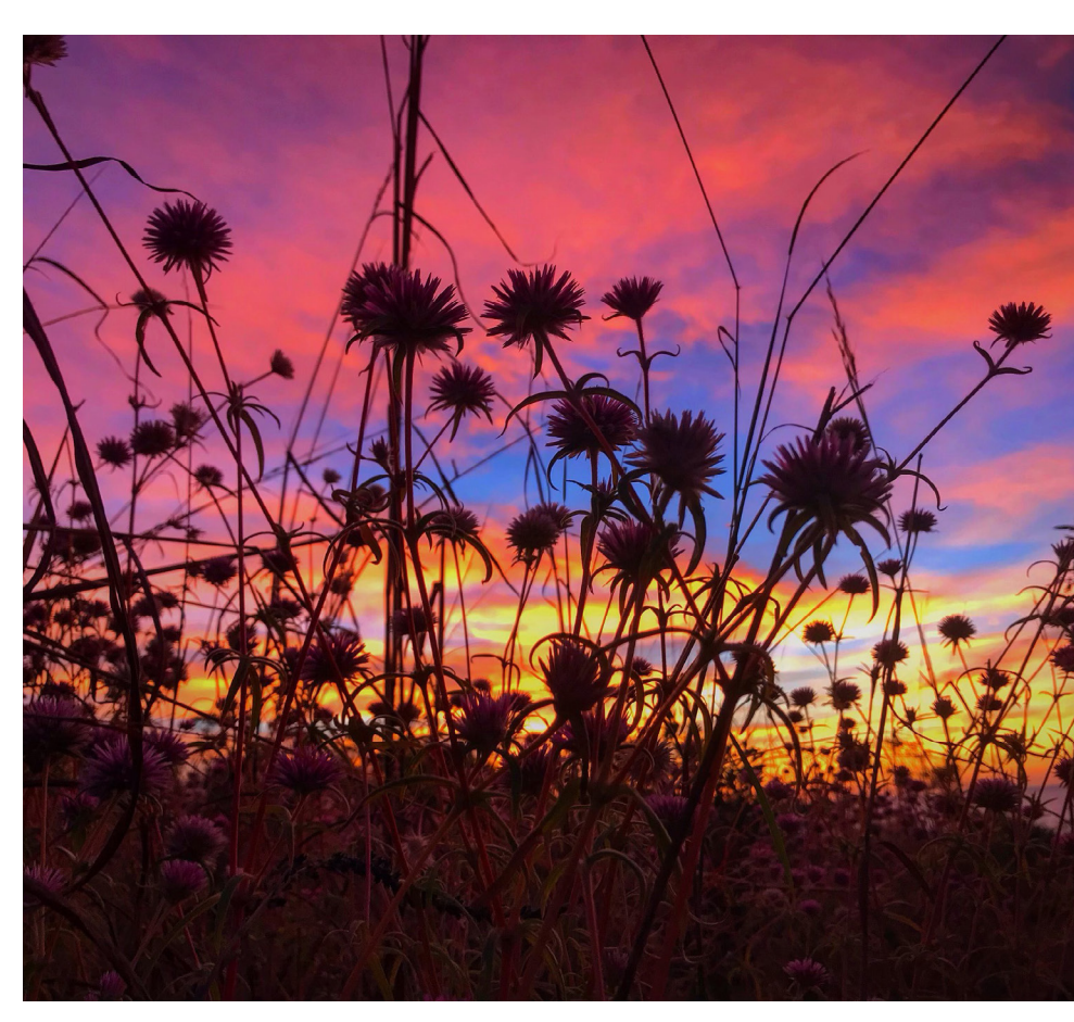
Togetherness is life's teachings, radiating light so one can see ahead, so to never fall.