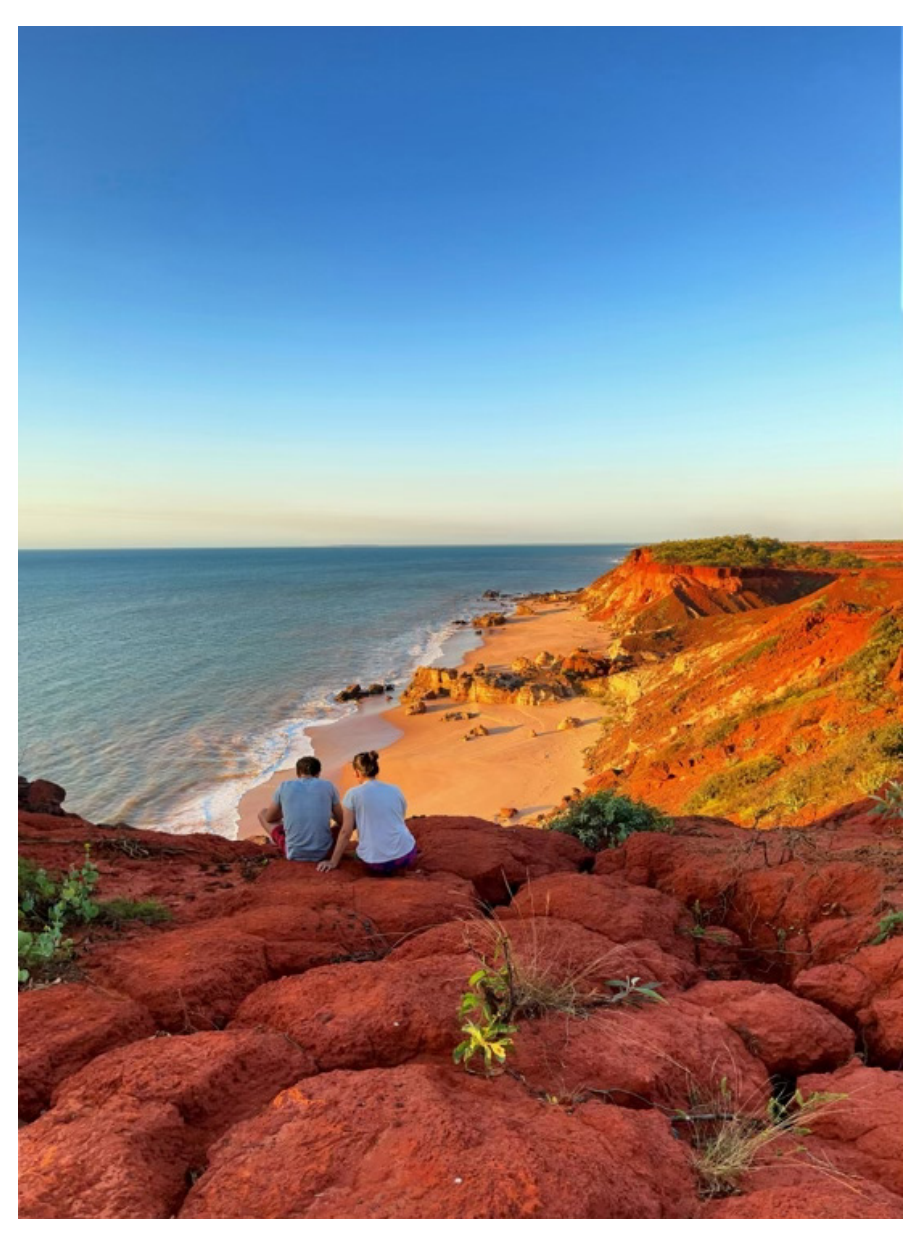
Never be a fraid of searching for new horizons, you may just surprise yourself with new beginnings.