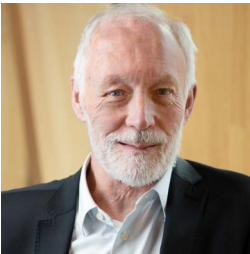
PROFESSOR PATRICK MCGORRY AO